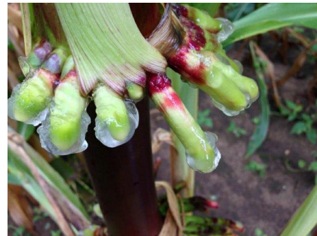
Nitrogen-fixing corn varieties secreting large amounts of sugar-rich gel as they grow in Madison, Wisconsin.