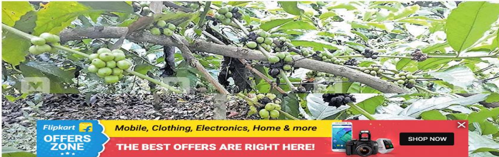
കാപ്പിക്കുരുവിന് അഴുകൽ രോഗബാധയുള്ള കാപ്പിക്കുപ്പടി.

മനോരമ ലേഖകൻ SEPTEMBER 15, 2019 07:42 AM IST