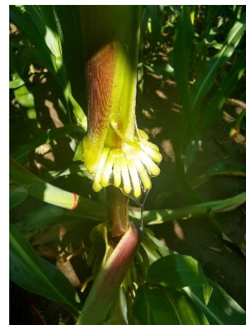
Clear mucilage drips from aerial roots on a stalk of corn grown this summer in research plots at the University of Wisconsin.