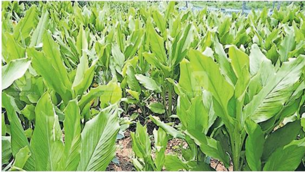
വെള്ളാറ്റുഞ്ഞൂർ ഗ്രാമത്തിൽ കർഷക കുട്ടായ്മ ആരംഭിച്ച മഞ്ഞൾ കൃഷി

മനോരമ ലേഖകൻ SEPTEMBER 25, 2019 02:41 PM IST