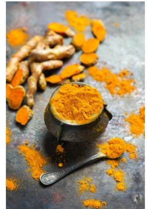
Cure from kitchen

With nearly 28 lakh cases, India had the world's highest number of TB patients in 2016 even though the researchers fear there are lakhs who escape the surveillance net. The disease causes one death every 90 seconds and 12 lakh new infections each year besides an economic burden of nearly $340 billion between 2006 and 2014.